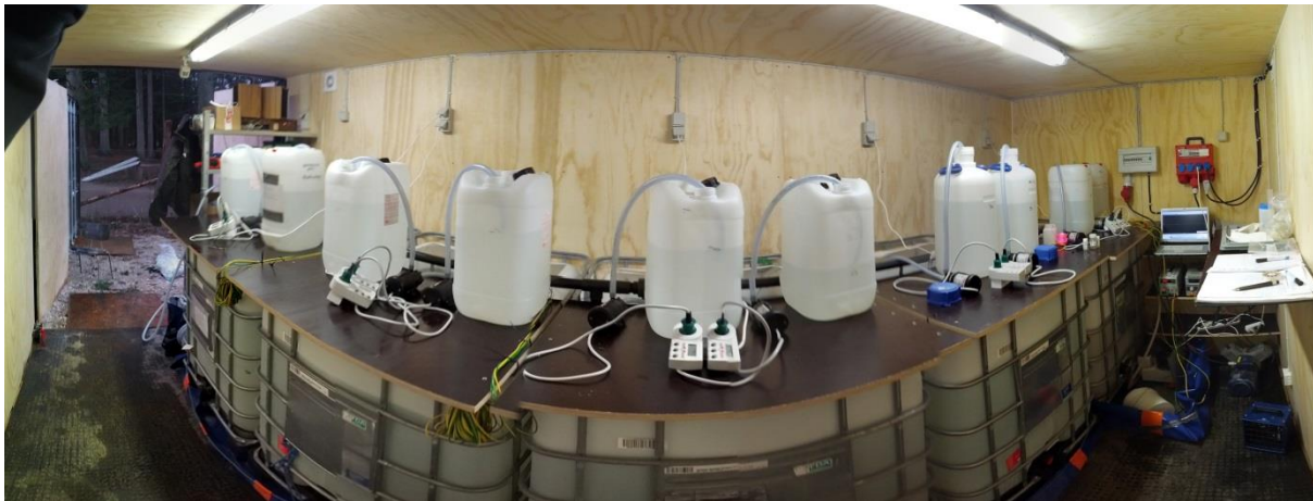
Figure B2 Placement of the electrochemical devices in the pilot scale